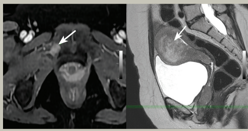
Figure 3. The left side of the picture shows bone metastasis in the right pubic bone. The right side of the picture shows endometrioid carcinoma in the uterus