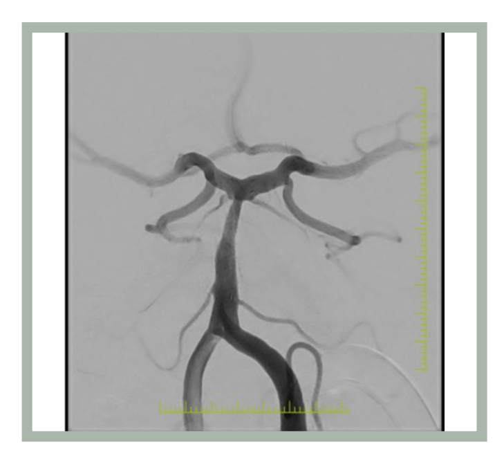
Figure 4. DSA-after the procedure DSA: Digital subtraction angiography

through the Willis polygon and that the superior basilar artery was severely narrowed distally.