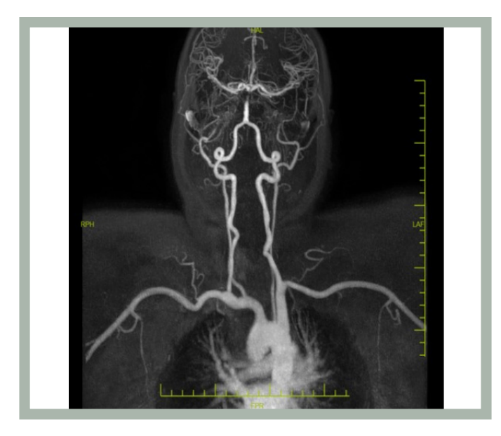
Figure 2. MRA MRA: Magnetic resonance angiography

role in the transmission of the disease (5,6). Studies suggest that the disease may be associated with the HLA DQB1 , B51 genes and 3, 6, 8 and 17 chromosomes (7,8). Considering that the mother of our patient died at the age of 30 due to sudden intracerebral hemorrhage, we had cranial and cervical angiomas in two children of our patient, considering the risk of possible MMD genetic transmission. We found no significant pathology in imaging. We did not perform genetic analysis either. In addition, studies have shown that infectious agents and autoimmunity are effective in pathogenesis (9,10). The presence of hypothyroidism in the history of our patient