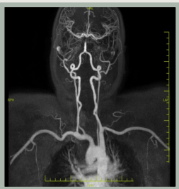
Figure 2. MRA