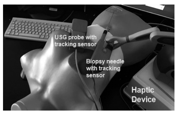
Figure 2. Ultrasound probe and biopsy needle with embedded trackers and the haptic device connected to the biopsy needle.

In the final phases of the study, it has been decided to use a torso for breast palpation training purposes instead of using an in-house produced silicone model. Therefore, 3B Scientific Breast Examination