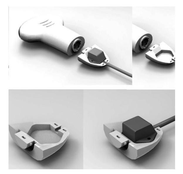
Figure 1. Tracking sensor embedded in the ultrasound probe mock-up.

netic source and two micro sensors. The tracker placement in the ultrasound probe mock-up can be seen on Figure 1.