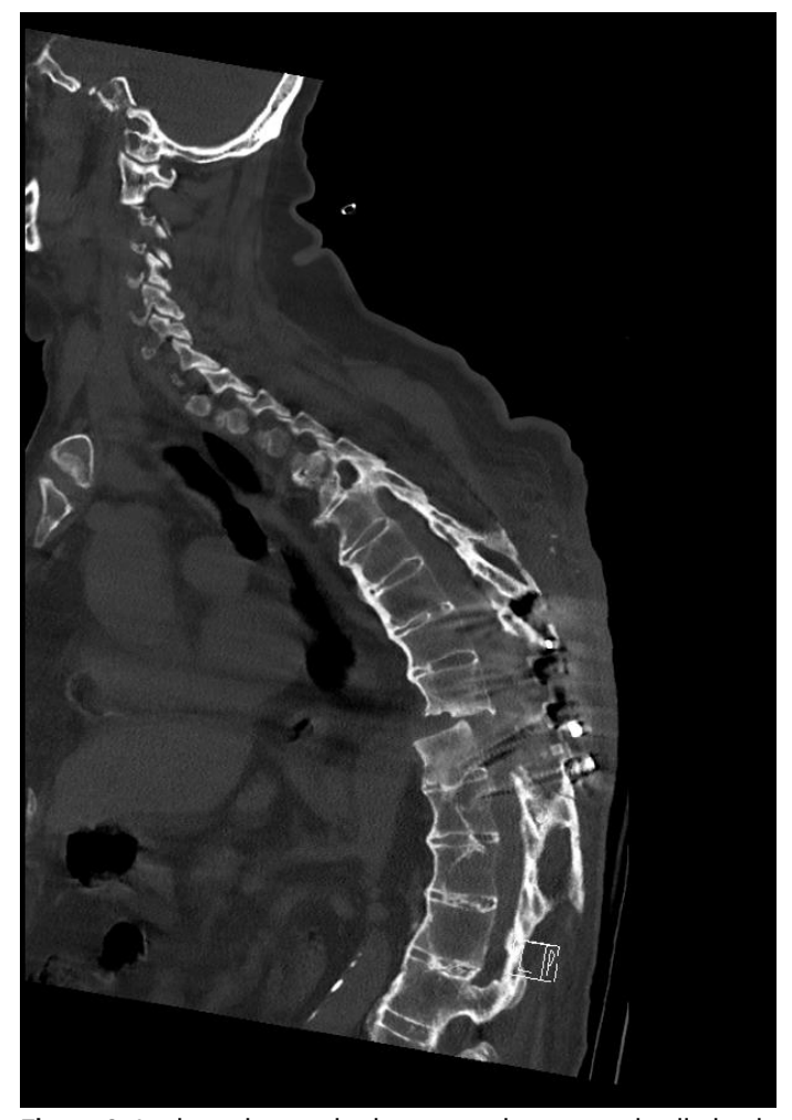
Figure 2 . In thoracic vertebral computed tomography, listhesis and instability are seen at the level of T9–10 vertebrae.

ical complications and early death has increased.<sup>[8]</sup> While it is stated that the risk of spinal cord injury is higher at the cervical level, there are also spinal cord injuries at the thoracic level, as in our case.<sup>[9,10]</sup> In addition, Cooper et al.<sup>[11]</sup> reported that the risk of vertebral fracture increases cumulatively and peaks in the third decade after diagnosis. Male gender, advanced age, low body mass index, osteoporosis, disease duration, degree of syndesmophyte development, peripheral joint involvement, increased modified Stoke AS Spine Score, decreased spinal range of motion, and increased occiput wall distance create vertebral fracture risk in individuals with AS.<sup>[12]</sup>