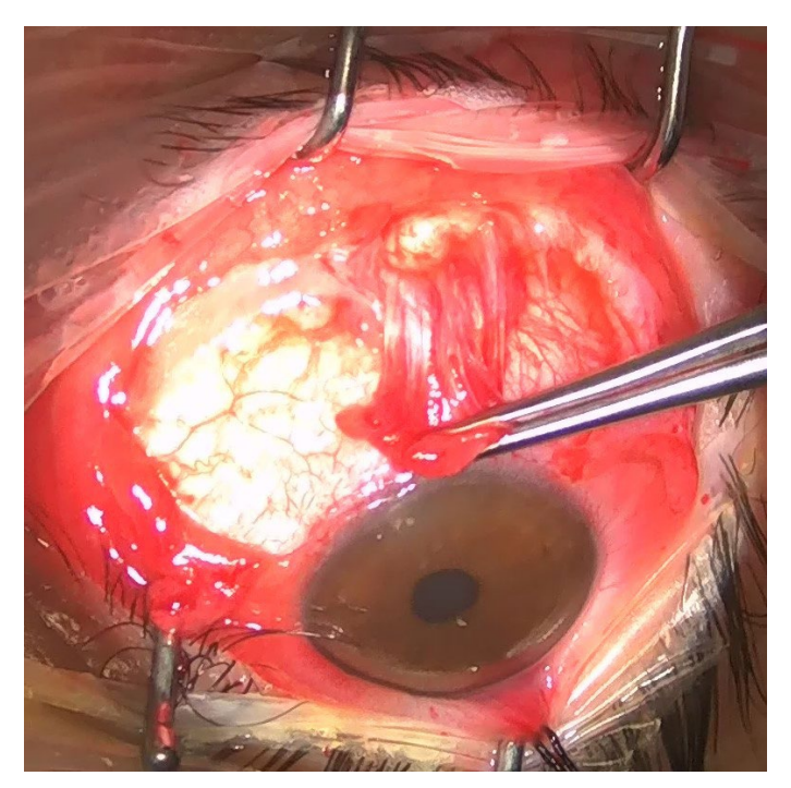
Figure 2. The inferior rectus muscle was completely cut.

surgical scrutiny of the lower quadrants did not reveal any indications of posterior globe trauma or open ocular injury. Inferior oblique and ligament connections were very helpful in finding the IR. The distal portion of the IR muscle was identified with the aid of forceps at the posterior aspect of the globe, and its position was corroborated through the elicitation of the oculocardiac reflex. Suturing of the proximal and distal ends of the IR muscle was executed using 6.0 vicryl (Fig. 4). The conjunctiva was closed, and subconjuncti-