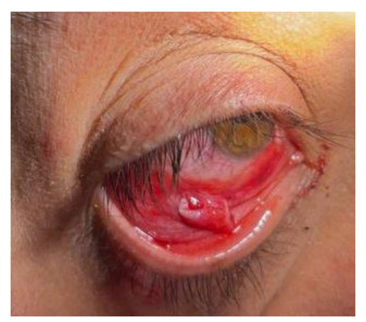
Figure 1. Tenon and inferior rectus muscle protruding from the conjunctiva.