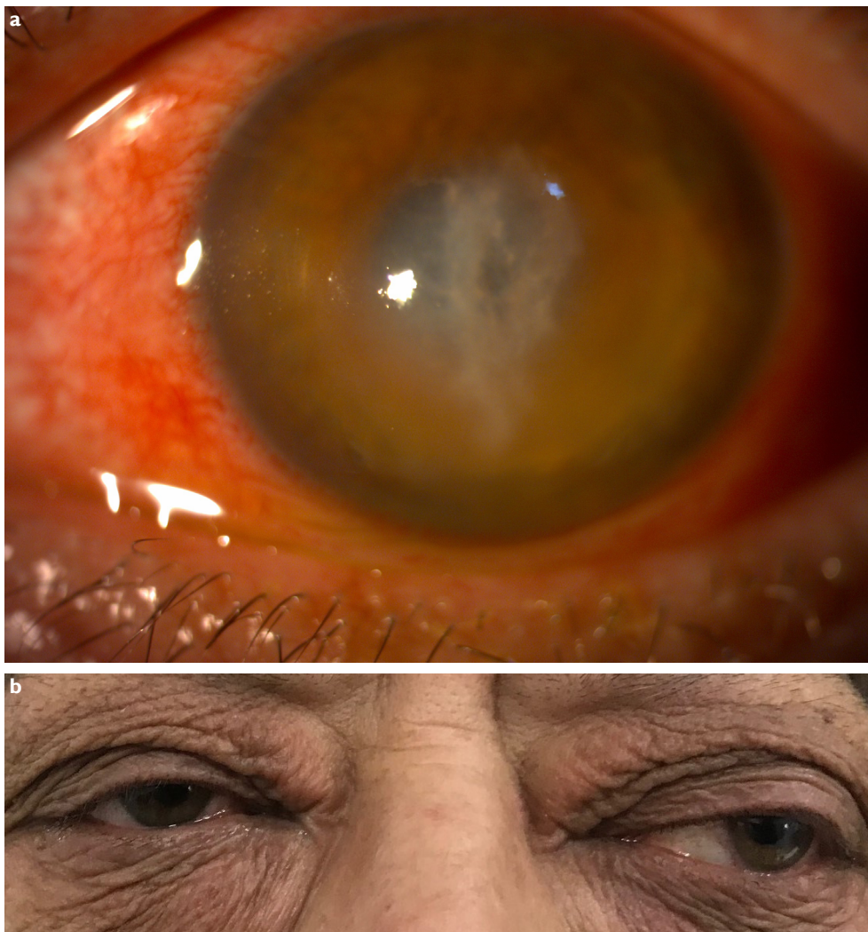
Figure 1. (a) Biyomicroscopic image of Case 1, left cornea edema in healing period with scarring. (b) Frontal photography of Case 1 demonstrative features of Graves' orbitopathy.

For the both cases, the diagnoses were, GO, keratoconus and ACH. Therapeutic contact lens was applied, topical medical treatment of cyclopentolate 1% 3 × 1/day, loteprednol 0.5% 5 × 1/day, preservative-free lubricant 6 × 1/day, hypertonic saline %5 3 × 1/day was administered. In the follow-up, both corneas were healed with corneal scars in 3 and 5 months, respectively.