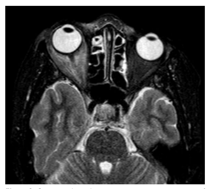
Figure 2. Contrast-enhanced magnetic resonance imaging section of the orbit at admission.

15 days. We discontinued the therapy without tapering. On examination in the 1st week, visual acuity increased to 20/25 on the right eye, serous detachment regressed, and retinal pigment epithelial changes were observed in fundus examination and OCT (Fig. 1b).