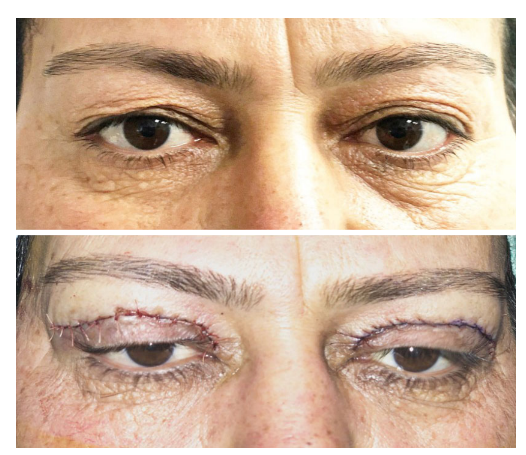
Figure 1. Preoperative and immediate postoperative image of a patient who has undergone upper eyelid blepharoplasty. The suturing was performed as interrupted in the right upper eyelid and running in the left upper eyelid.