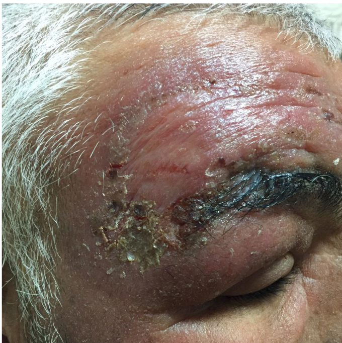
Figure 1. Eyelid edema and crusted lesions mainly located on the lateral aspect of the right eyebrow.