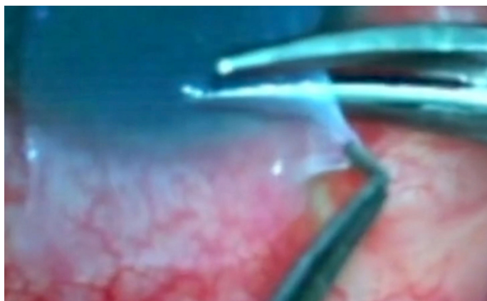
Figure 2. It was seen that the first layer of amniotic membrane is applied over the tube with the epithelial side.