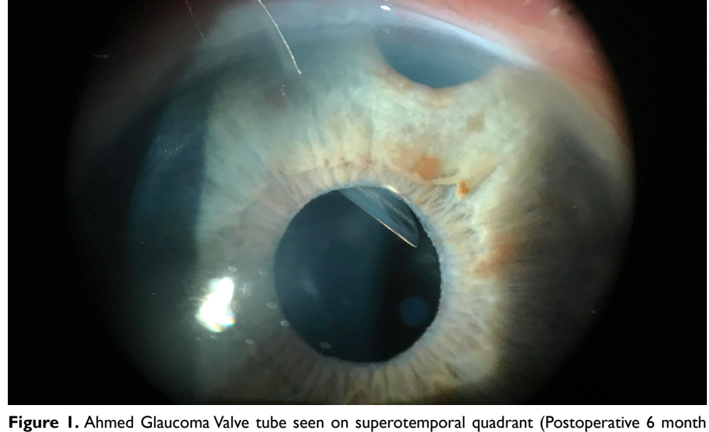
Figure I. Ahmed Glaucoma Valve tube seen on superotemporal quadrant (Postoperative 6 month anterior segment photo).

An AGV was implanted using a long scleral tunnel technique in either the upper temporal quadrant (Fig. 1) or the