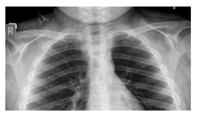
Figure 1. Air trapping in the left lung in the chest x-ray image.

In his physical examination, wheezing was heard bilaterally. He had no sign of respiratory failure. On the chest x-ray, air trapping was seen in left lung (Figure 1). FOB was planned because foreign body