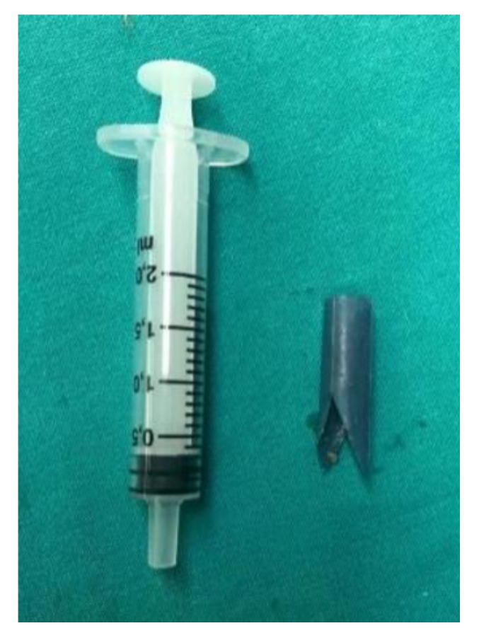
Figure 3. The lenght of the foreign body (approximetely 1,5 cm tall).

nea, stridor and focal monophonic wheezing, or decreased air entry could be presented <sup>(5)</sup>. Clinical and abnormal chest x-ray findings such as aeration difference are major diagnostic factors for FBA. Besides, it should be kept in mind that physical examination and radiological findings in patients with suspected FBA may be normal or may reveal nonspecific findings <sup>(6)</sup>.