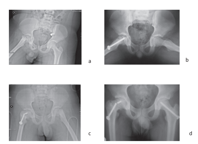
Figure 2a. 10 years old patient with Down syndrome. Preoperative image of acute unstable SCFE. b. Postoperative 0 day frog-leg X-ray. c. Postoperative 15. months failure of screw was seen in antero-posterior image and acute SCFE was occured in contralateral hip. d. Postoperative 32. months image.

A measurement of Southwick's angles after revision revealed a statistical significance (p=0.015). There was no increase in the postoperatively measured angles among patients who underwent revision surgeries.