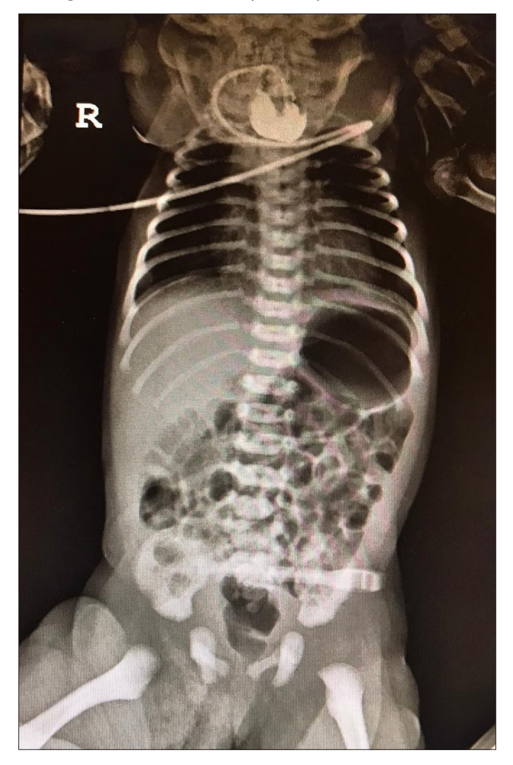
Figure 1. Radiograph obtained with a thin catheter in a patient (radiographic and intraoperative levels were not compatible and the upper esophageal pouch was detected at the 3<sup>rd</sup> thoracic vertebral level during surgery)

Primary repair was performed via thoracotomy through the 3<sup>rd</sup> intercostal space in patients in whom the