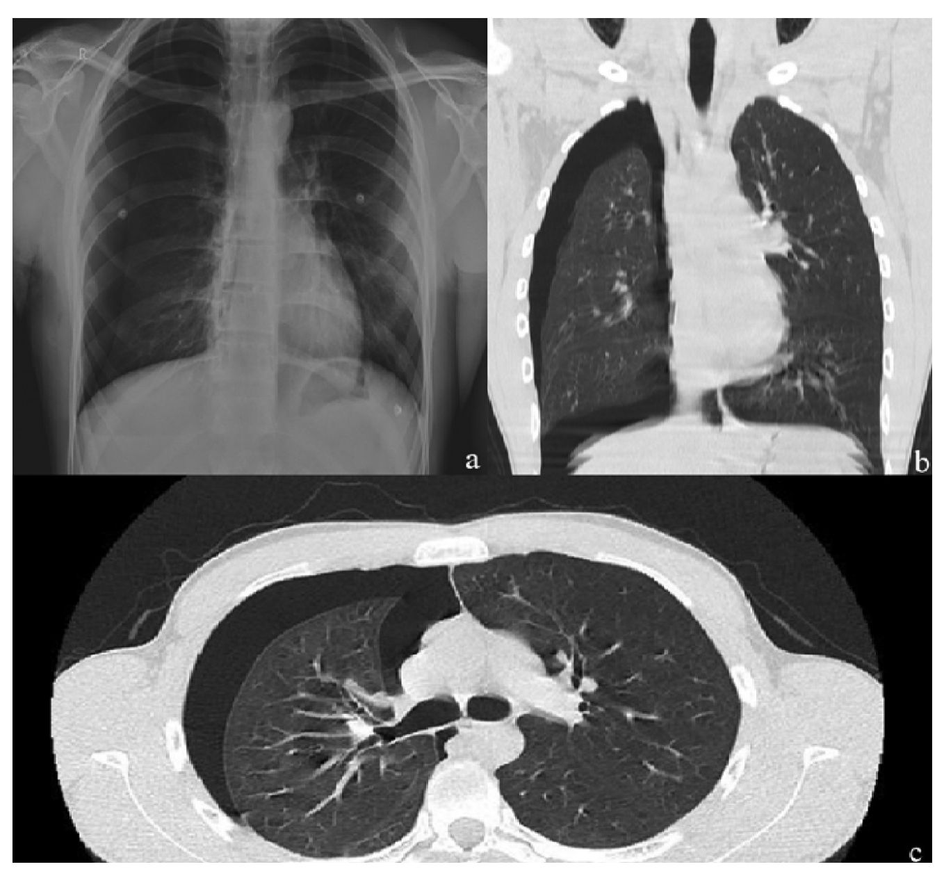
Figure 1. Pneumothorax sign in the right hemithorax of the patient, on chest X-ray (a) and in coronal (b) and horizontal (c) sections of thorax computed tomography.

(RT-PCR) method (Bioeksen, Istanbul, Turkey) which yielded a positive result. Since physical examination findings, routine blood test results and thorax CT scans were not remarkable, outpatient monitoring without treatment was planned for the patient. However, the patient was re-admitted nine days after the positive RT-PCR test result was obtained due to newly developed chest pain and shortness of breath. Respiratory distress, low oxygen saturation and decreased respiratory sounds were detected on