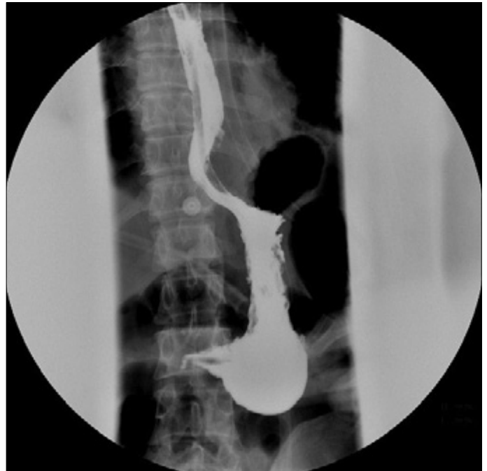
Figure 3. Esophagography

Boerhaave's syndrome was first defined by a Dutch physician, Boerhaave, in 1704. It is five times more common in men than in women. It is most frequently seen after vomiting and heaving etiologically and less frequently seen after stretching, giving birth, severe coughing, blunt trauma, epilepsy, asthma, and difficult swallowing (4).