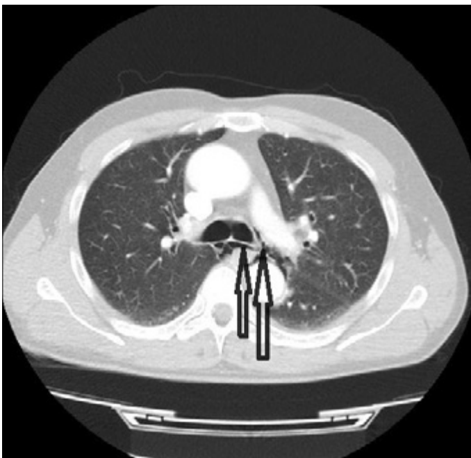
Figure 2. Thoracic computed tomography

was discharged after 10 days with total recovery, following postoperative intensive care and service care (Figure 3).