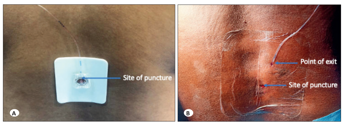
Figure 1. Epidural catheter fixation techniques. Catheter fixation by A) Fixator device (Locklt Plus®) B) Subcutaneous Tunnelling.

operative epidural infusion with an elastomeric pump (Royal Fornia Medical Equipment Co Ltd). All patients were followed up by the acute pain service resident twice daily in the postoperative period until the epidural catheter was removed. During the first 72 h when epidural analgesia was delivered, pain scores were noted every 4 h. A visual analogue scale (VAS) of \geq 4 was treated with rescue analgesic tramadol 50 mg intravenous. Epidural analgesia was discontinued in cases of inadequate analgesia, with outward migrations exceeding 2 cm and alternative analgesia methods was provided. Each patient was also assessed daily for catheter migration, catheter dressing, analgesia adequacy, and catheter insertion site inflammation (defined as an area of erythema and induration >5 mm around the skin exit site and/or visible pus). The satisfaction scores were noted on a 5-point scale with 1 denoting the least satisfaction and 5 indicating high satisfaction.