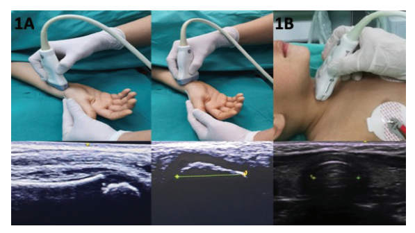
Figure 1. Ultrasonography measurement of epiphyseal diameter of distal radius and subglottic airway diameter. A. Epiphyseal transverse diameter of distal radius. B. Subglottic transverse airway diameter at cricoid cartilage level