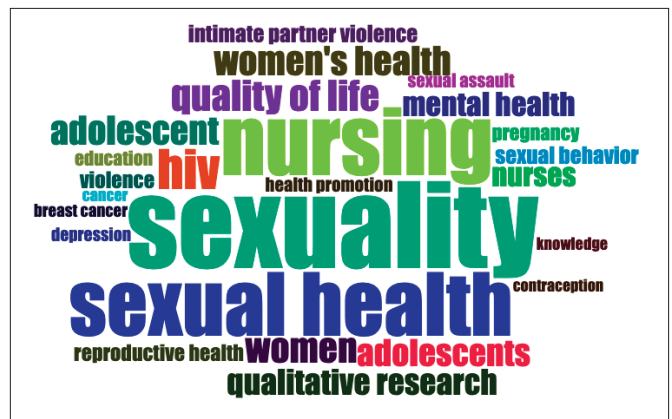
Figure 2. Word Cloud of sexual health in nursing research

Notes: As the frequency of words increases, they appear bigger in the word cloud.