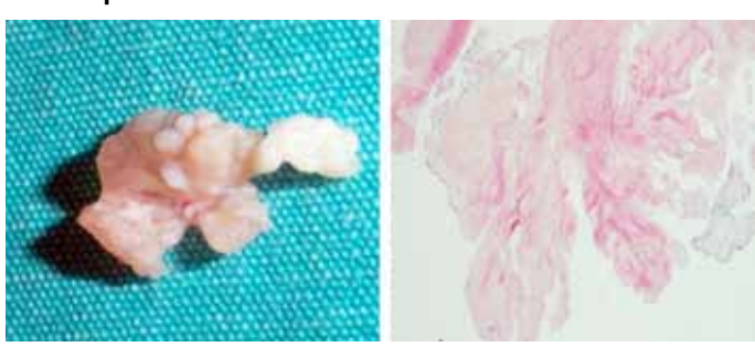
Figure 3. Macroscopic view of the tumor that shows papillary projections (left panel). Microscopic examination shows papillary fibroelastoma with branching papillae, which is composed of central avascular collagen and variable elastic tissue surrounded by endothelial cells [hematoxylin and eosin stain; original magnification x40 (right panel)]

(Fig. 2). Pathologic examination revealed CPF (Fig. 3). Macroscopically, the lesion was white-yellowish in color and rubbery in consistency. Microscopy revealed branching papillae from the tumor that were composed of central vascular collagen and variable elastic tissue, surrounded by acid mucopolysaccharide and endothelial cells. At 11-month follow-up, the patient was well and free from a neurologic event.