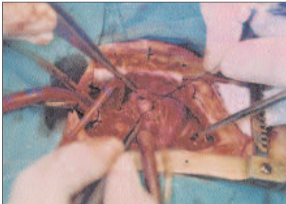
Figure 2- Gross features of rhabdomyoma removed during operation..

walls. They can occur as single intramural or intracavitary masses in 10% of patients. Occasionally rhabdomyoma causes obstruction to blood flow as our in case (1-7).