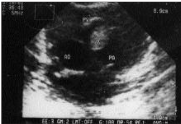
Figure 1- Preoperative echocardiogram. Parasternal short axis view shows a tumour mass obstructing the right ventricular outflow tract. (PA: Pulmonary artery, Ao: Aorta, X: Tumour mass, PV: Pulmonary valve).