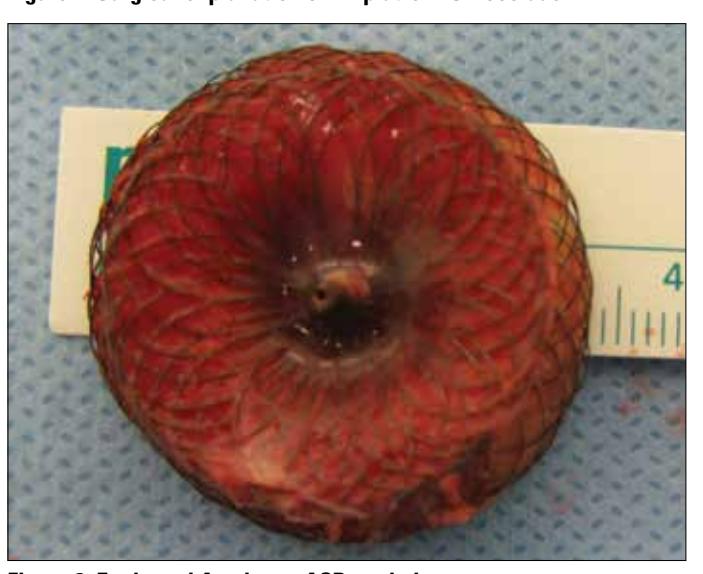
Figure 3. Explanted Amplatzer ASD occluder

intervention. Malposition, migration, arrhythmias, residual shunts, cardiac perforation, valve regurgitation, infectious endocarditis, thrombus formation, and sudden death have all been reported (5, 6). A metal allergy severe enough to require device removal is a rare complication of the device. Although high blood nickel levels may not be a concern in most patients receiving the device, patients with a metal allergy may present with an allergic reaction. This reaction to the device has been documented as dermatitis, bronchospasm or pericardial effusion (7-9). The clinical significance of nickel release after device implantation in patients without metal allergy is unclear and is subject to further studies. Endothelization may prevent systemic exposure to nickel. If the occluder is eventually surrounded by fibrous tissue and not exposed to inflammatory cells, then the hypersensitivity reaction may eventually cease. If symptoms persist and hypersensitivity reactions are unresponsive to medical therapy, surgical explanation of the device should be considered as in our case. In a cardiac operation, any permanent nickel containing material like sternal wires should also be avoided and nickel-free sternal fixation systems (like polyetheretherketone) or poly-