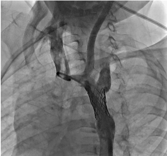
Figure 3. Final aortogram showing successful dilatation of interruption, with no residual gradient

one of the youngest patients presented in the literature. The luminal obstruction of aorta was perforated with Terumo guidewire and a new aortic lumen was created, then the stent was implanted working diligently. During this procedure, firstly we should perform an angioplasty with coronary angioplasty balloon to dilate the passage, but it was not needed because the catheter and long sheath were placed easily. The short- and medium-term results of the procedure were excellent.