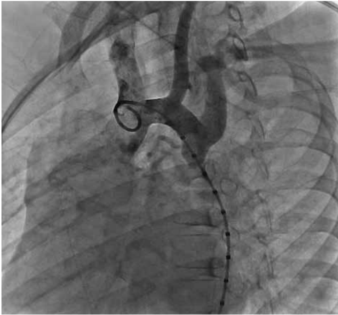
Figure 2. Retrograde contrast injection reveals no contrast pass from coarctation