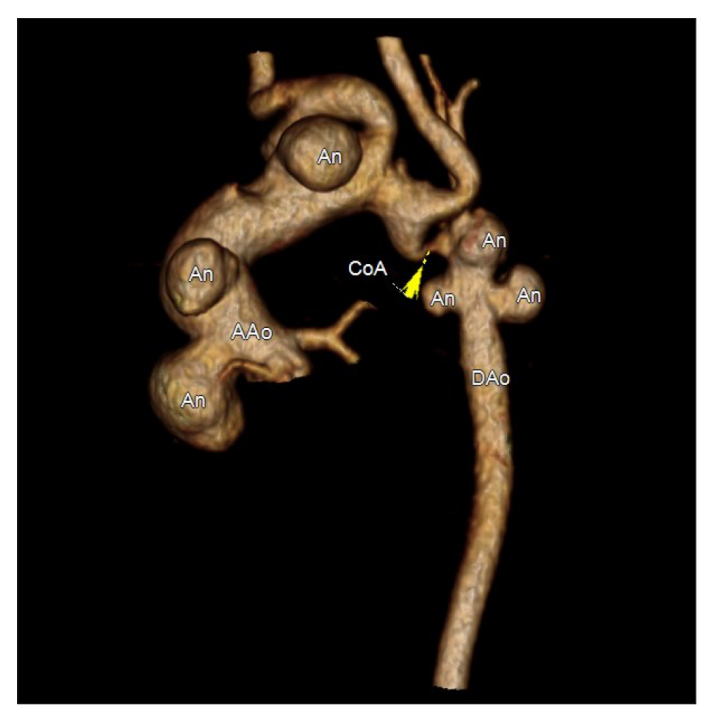
Figure 1. Computed tomography angiography showing saccular aneurysms and re-coarctation of aorta

A 6-month-old-boy was referred to our clinic owing to recoarctation of aorta (CoA). His medical history revealed that he underwent a surgical repair of the CoA using an extended end-to-end method with lateral thoracotomy in his first month of life. After successful balloon angioplasty in the early postoperative period, he was discharged from the hospital uneventfully. He was referred to our center again with the diagnosis of IE owing to a major embolic event in the second month of his follow-up. Two-dimensional transthoracic echocardiography revealed severe aortic regurgitation, aortic cusp prolapsus, bicuspid aortic leaflet thickening, and severe re-CoA at the descending aorta. There were also mobile vegetation and multiple pseudoaneurysms in the aorta. His blood cultures (48 hours apart) were