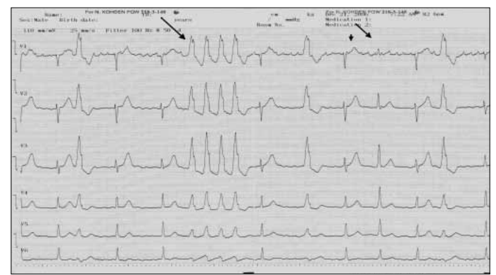
Figure 2. ECG showing atrial flatter rhythm, maximal preexcitation (large arrow), normal conduction (arrow head) and minimal preexcitation (small arrow)