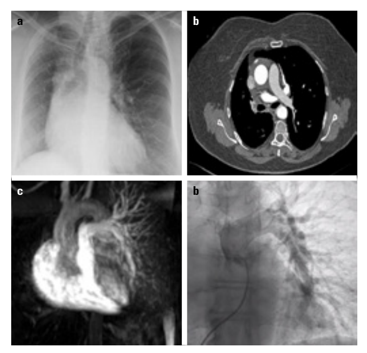
Figure 1. (a) Chest X-Ray demonstrates right hemithorax hypoplasia with an elevated right hemidiaphragm. (b) Computed tomography slice shows the absence of the right pulmonary artery. (c) Magnetic resonance angiography demonstrates the absence of a right pulmonary artery. (d) Pulmonary angiography shows the absence of the right pulmonary artery with a dilated left pulmonary artery

Cardiovascular anomalies such as septal defects, Fallot's tetralogy, patent ductus arteriosus, and right aortic arch may accompany UAPA (4). The isolated absence of the right PA is more common than that of the left (63%). Right-sided UAPA is less associated with other cardiac anomalies and patients with this