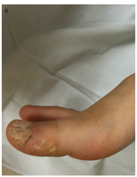
Figure 1. Cutaneous findings of Carvajal disease in our patient. (a) Peculiar woolly hair, (b) palmar keratoderma, and (c) plantar keratoderma

eventually to fibrosis (4). Mutations in genes encoding desmosomal proteins have been associated with DCM and arrhythmogenic right ventricular disease (ARVD) (2).