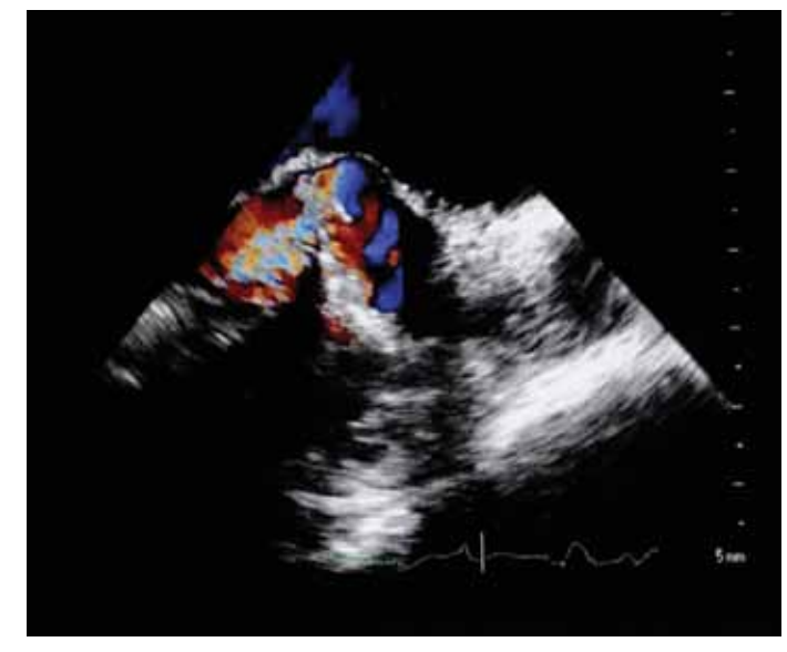
Figure 1. Two-dimensional transesophageal echocardiogram shows the paravalvular leaks

A 33-year-old man applied to hospital with shortness of breath. He had previous history of aortic valve replacement due to severe aortic stenosis. We detected diastolic murmur along left sternal border on physical examination. According to blood test results, he had anemia (Hemoglobin 10.9 g/dl) and elevated bilirubin levels. Transthoracic echo-cardiography revealed an increased left ventricular wall thickness (interventricular septum diastolic thickness 13 mm) and normally functioning left ventricle (ejection fraction 58%, diastolic internal diameter 48 mm). However, there was a moderate degree leak related to prosthetic aortic valve, and hence, we decided to perform TEE (Fig. 1). A Philips I33 machine (Andover, USA) equipped with X7-3 probe was used for this purpose, which revealed a posteriorly located moderate to severe aortic paravalvular leak. We measured paravalvular defect diameter as 5 mm by activating 3D zoom and viewing resulting image with grid lines (Fig. 2, 3,