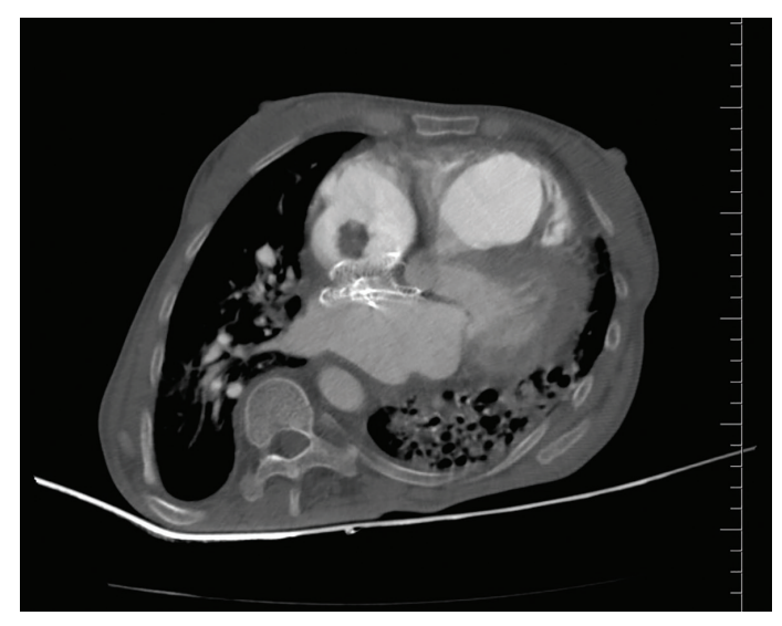
Figure 2. Computed tomography angiography of the thorax demonstrating the ball-like thrombus in the right atrium adjacent to the atrial septal defect closure device

Video 1. Transthoracic echocardiographic apical four-chamber view