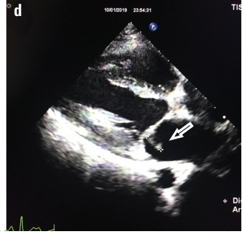
Figure 1. (a) On the left hand, Osler nodules (red arrow) and janeway lesions (black arrow) along with cyanosis in the fingers. (b) Osler nodules (red arrow) and janeway lesions (black arrow) on the foot. (c) Complete atrioventricular block with junctional escape rhythm on electrocardiography. (d) Mobile and fibrillary like vegetation seen on the anterior leaflet of mitral valve on transthoracic echocardiography (white arrow)