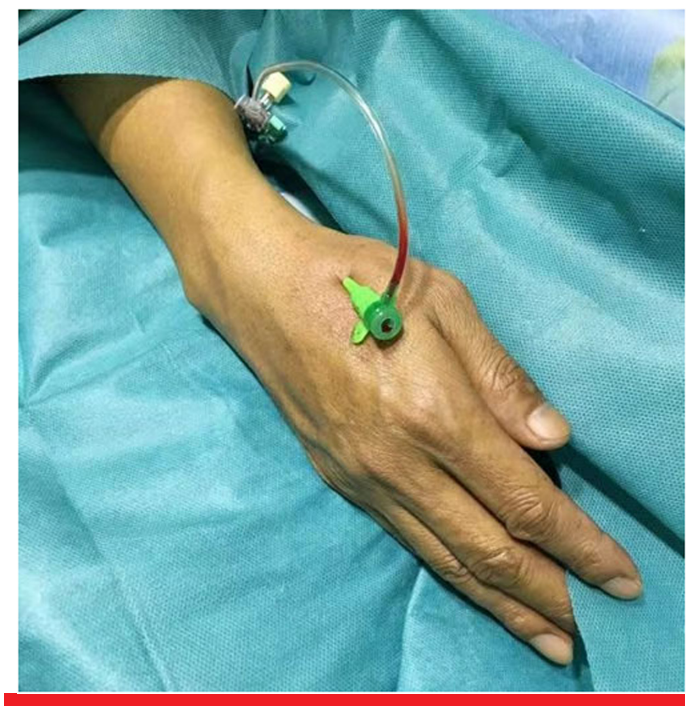
Figure 2. Insertion of 6F sheath through distal radial artery.

According to the 2013 ESC guidelines,<sup>3</sup> CAG or PCI is the first choice for TRA in patients with coronary heart disease. However, the radial artery is thinner than the femoral artery, and the puncture time may be longer. Patients with ST-segment elevation myocardial infarction (STEMI) are in critical condition and require the culprit vessels to be opened for the shortest possible time, so TRA was not previously recommended. However, with the constant maturity and development of TRA technology, the 2017 ESC guidelines declared TRA as the first choice for CAG or PCI in patients with STEMI.<sup>21</sup>