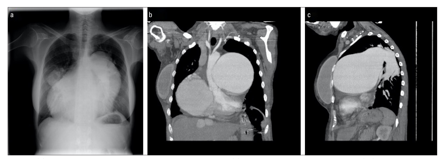
Figure 2. (a) Chest X-ray showing a bulging mass in the left hemithorax. (b) Coronal view of computed tomography (CT) demonstrating giant pulmonary artery aneurysm with a diameter of 10 cm. (c) Sagittal view of the aneurysm

PAH is a progressive cardiopulmonary disease characterized by elevated pulmonary vascular resistance and PAP. In the classification of the European Society of Cardiology, PAH is defined as Group 1 and can be idiopathic, heritable, drug- and toxininduced, or associated with clinical conditions, including HIV infection, connective tissue disease, portal hypertension, and congenital heart disease (5).