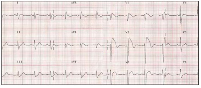
Figure 2. Brugada type I electrocardiogram