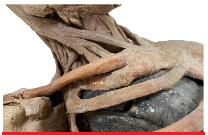
Figure 1. A photograph showing a course and inclination angle of the first rib and its anatomical relationship with the clavicle. Sided BCV descending almost vertically and the right. Sided BCV descending obliquely to the left. BCV, brachiocephalic vein; SVC, superior vena cava.

turned away and raised in a supine position. Confirm the length, width, and midpoint of the Blue zone. The position of skin entry point depended on the individualized width and angle of the clavicle. The wider the clavicle is, the farther the skin entry point is from the clavicle. The skin entry point was located by using an isosceles triangle, the 2 equal legs had a length of 1.5-2.0 times the clavicle width, and the midpoint of the base was the position of the skin entry point. One leg of this isosceles triangle was perpendicular to the midsternal line, and the other leg was perpendicular to the long axis of the Blue zone. Put the left middle finger on the midpoint of the Blue zone and use the left thumb to help guide an 18-gauge needle underneath the clavicle inserting it toward the top of the middle finger until venous blood was freely aspirated (Figure 2A).