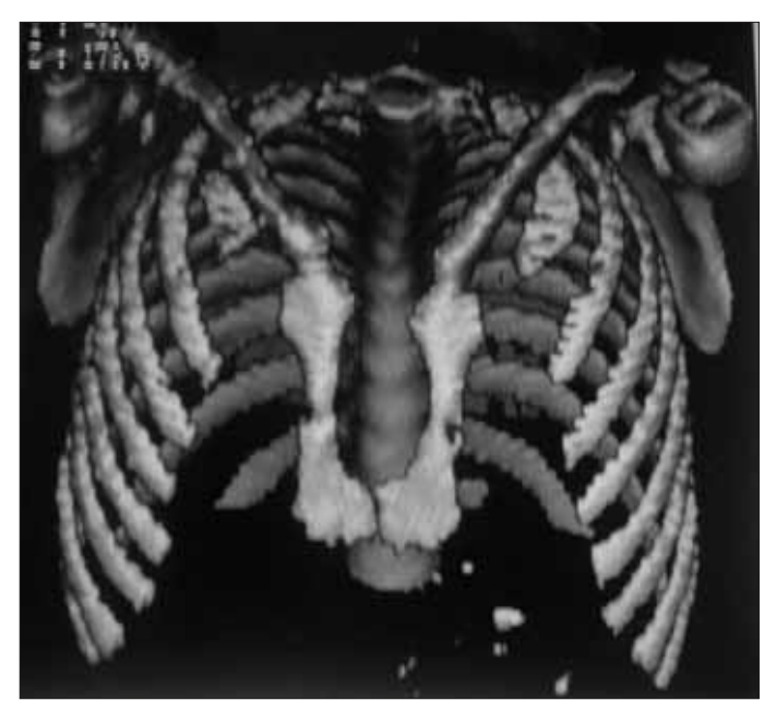
Figure 2. Three-dimensional thorax computed tomography image of a complete fusion defect of the sternum

Ersin Günay, Ziya Şimşek*, Gökhan Güneren**, Fatih Çelikyay*** From Clinics of Chest Diseases, *Cardiology, **Thoracic Surgery and ***Department of Radiology, Girne Military Hospital, Girne, Turkish Republic of Northern Cyprus