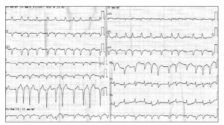
Figure 1. ECG before