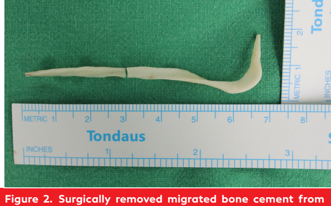
Figure 2. Surgically removed migrated bone cement from the right heart.