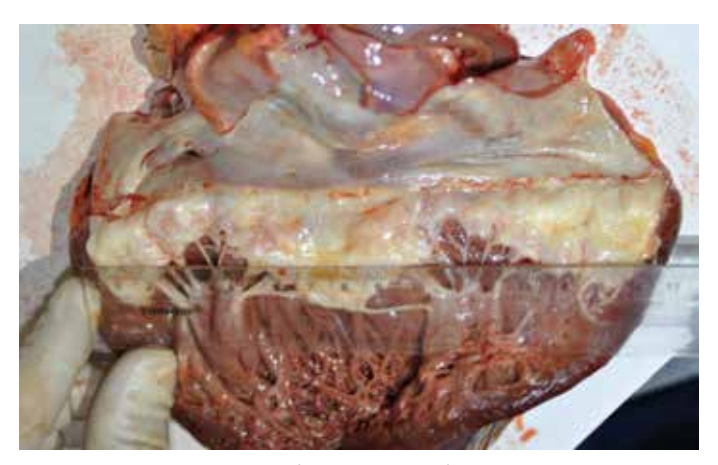
Figure 1. A giant mitral valve (17 cm in length)

Study material for genetic screening of cardiomyopathies was selected from case database at the Department of Forensic Medicine, Near East University (NEU), upon a request from the