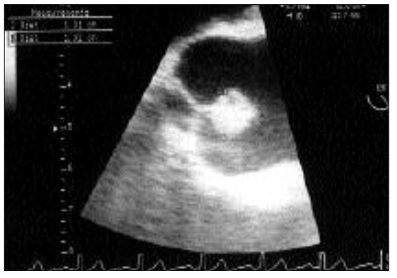
Figure 1. Transesophageal long axis view of aortic valve depicting papillary fibroelastoma with a short pedicle attached to the right coronary cusp

As a conclusion; the natural history of PFEs remains unknown, surgical management is recommended beca-