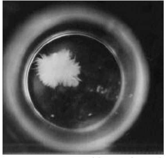
Figure 2. Macroscopic view of the tumor shows multiple frond-like structures (photographed under water) giving it the appearance of the sea anemone