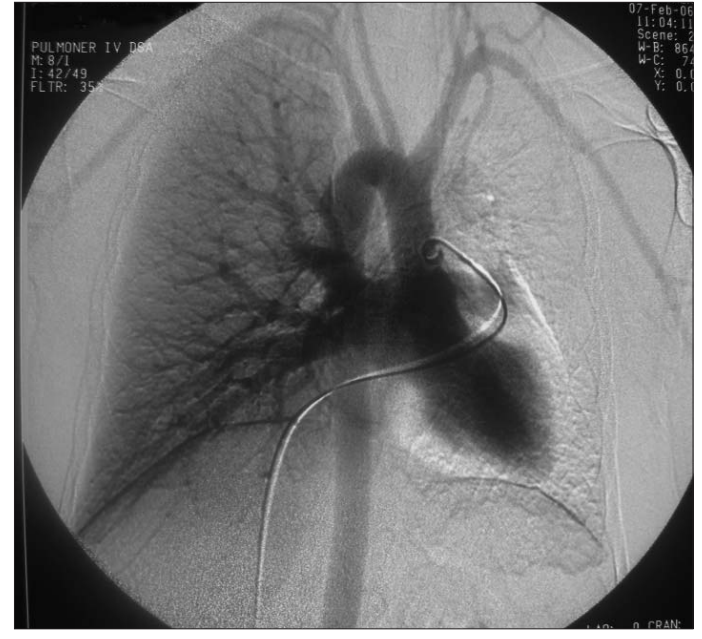
Figure 4. Pulmonary digital substraction angiography view of the absence of the left pulmonary artery

Most of the cases in the literature were diagnosed with the development of recurrent pneumonia. Some of the cases in the literature were detected coincidentally during screening for tuberculosis. There is