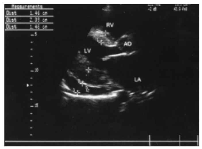
Figure 1. Transthoracic echocardiography, parasternal long-axis view showing hypertrophied left ventricle, pericardial effusion and dilated left atrium. Arrow indicates pericardial effusion

There is high prevalence of congenital heart defects in patients with Turner's syndrome. Aortic malformations, including bicuspid aortic valve, coarctation of the aorta and aortic dilation are the most common. Hypertension, which may cause left ventricular hypertrophy is frequent in Turner's syndrome (1). However there was no hypertension in our