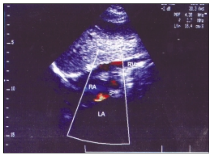
Figure. 2. Transthoracic echocardiography, subcostal view. Interatrial septal defect is shown. Arrow indicates left to right atrial shunt

LA - left atrium, RA- right atrium, RV- right ventricle