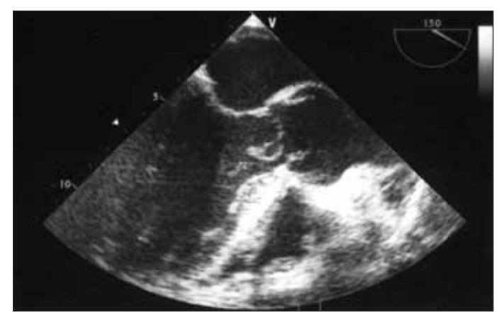
Figure 6. Transesophageal echocardiography, 150-degree, systolic frame view: An accessory mitral valve (arrow) prolapsing through the aortic valve during systole

anakarder.com). During TEE, no other congenital cardiac abnormalities found and no spontaneous echo-contrast or thrombus formation were detected. Cardiac catheterization revealed normal coronaries and LVOT gradient of 30 mmHg. In the absence of relevant obstruction of LVOT, patient is being followed up without surgical intervention and was recommended to start oral anticoagulation treatment with phenprocoumon to prevent recurrent cardioembolic events and prophylaxis for bacterial endocarditis.