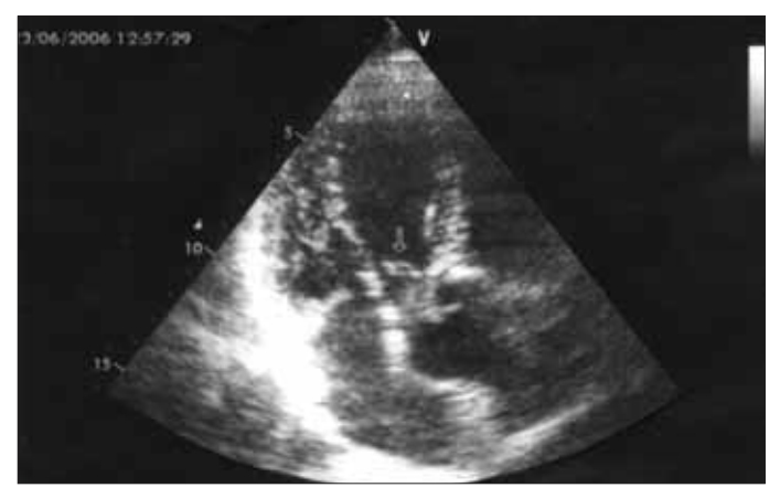
Figure 3. Transthoracic echocardiographic apical 5-chamber view of a vegetation-like mass beneath the aortic valve (arrow)

movie images at www.anakarder.com). A mild subaortic obstruction (maximum gradient 80 mmHg, mean gradient 55 mmHg) was demonstrated. Mild aortic regurgitation and mitral regurgitation were detected on color Doppler examination (Fig. 3, 4 and Video 2, 3. See corresponding video/movie images at www.anakarder.com). Transesophageal echocardiography (TEE) revealed an accessory mitral valve (AMV) tissue adhering to anterior mitral valve leaflet and ballooning into LVOT during systole (Fig. 5, 6 and Video 4-6. See corresponding video/movie images at www.