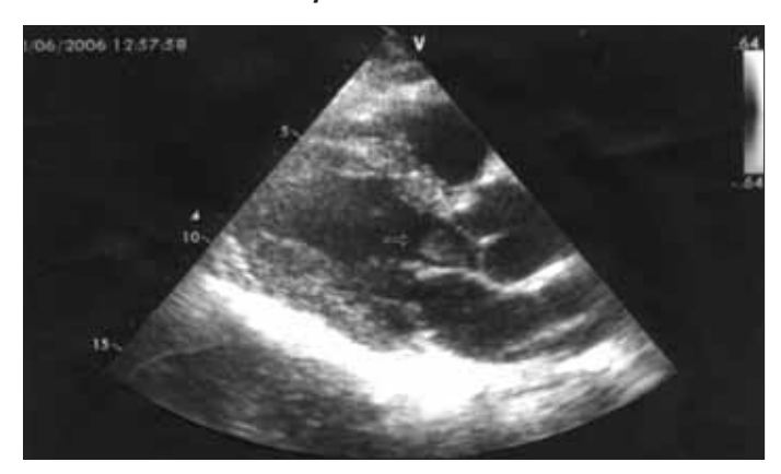
Figure 2. Transthoracic echocardiographic parasternal long-axis view of a mass in left ventricular outflow tract beneath the aortic valve (arrow, diastole)

movie images at www.anakarder.com). A mild subaortic obstruction (maximum gradient 80 mmHg, mean gradient 55 mmHg) was demonstrated. Mild aortic regurgitation and mitral regurgitation were detected on color Doppler examination (Fig. 3, 4 and Video 2, 3. See corresponding video/movie images at www.anakarder.com). Transesophageal echocardiography (TEE) revealed an accessory mitral valve (AMV) tissue adhering to anterior mitral valve leaflet and ballooning into LVOT during systole (Fig. 5, 6 and Video 4-6. See corresponding video/movie images at www.