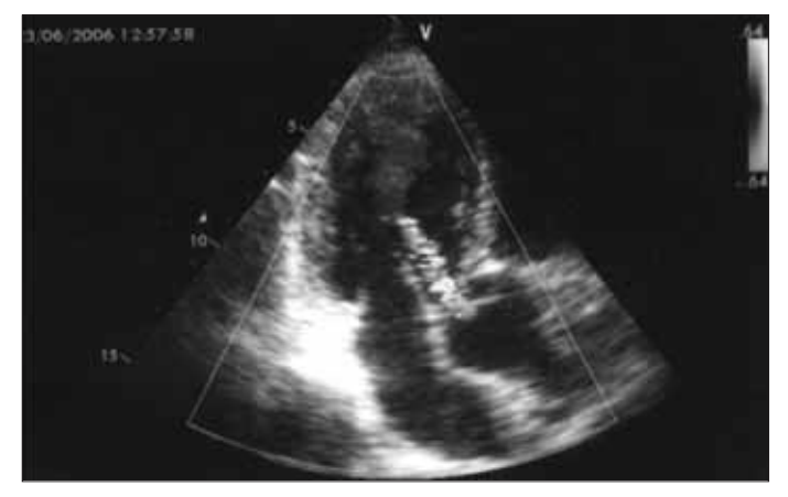
Figure 4. Colour Doppler image of a mild aortic regurgitation