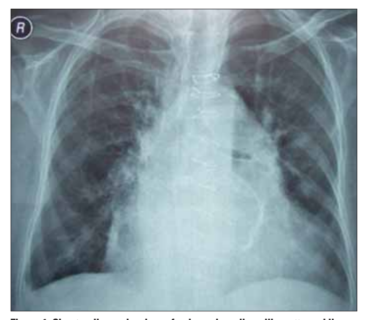
Figure 1. Chest radiography view of enlarged cardiac silhouette and linear calcification on the left atrial zone

was admitted to our department because of chest pain, dyspnea and pretibial edema. On physical examination she had arrhythmic heartbeats, 2/6 systolic murmur on the second left intercostal space, ++/++ pretibial edema, painful hepatomegaly and venous jugular distension. The electrocardiography revealed atrial fibrillation with a ventricular rate of 60 beats/min and ST depression in the inferolateral derivations. Chest radiography demonstrated an enlarged cardiac silhouette and linear calcification on the left atrial zone (Fig. 1). Echocardiogram demonstrated normal left ventricular function, moderate mitral stenosis (mean gradient was 6 mmHg), moderate aortic regurgitation and severe tricuspid regurgitation. Left atrium was dilated and the calcification covered entirely the left atrium (Fig. 2). Catheterization and coronary angiography showed normal coronary arteries, mitral stenosis (mean gradient 6 mmHg) and high systolic pulmonary artery pressure (65 mmHg). Ventriculography showed mild mitral regurgitation, extensive calcification of the left atrial zone (Fig. 3a). Aortography also showed extensive calcification of the left atrial zone (Fig. 3b) and 1-2° aortic regurgitation. The patient was discharged with suggestion of surgical operation on the mitral and tricuspid valves.