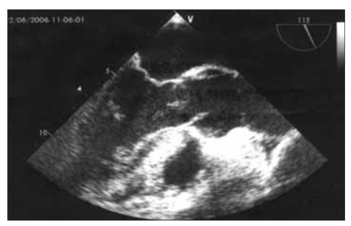
Figure 5. Transesophageal echocardiography, 115-degree, systolic frame view: An accessory mitral valve (arrow) prolapsing through the aortic valve during systole