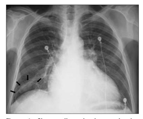
Figure 1. Chest radiography image showing increased cardio-thoracic ratio and the cavitary mass in the right lower lobe (black arrows)

the appropriateness for cardiac transplantation we decided to perform cardiac catheterization. Before the procedure, routine laboratory tests including blood tests and chest radiography were obtained. A cavitary mass was seen within the right lower lobe neighboring diaphragm (Fig. 1). The patient had non-productive cough. His past medical history was scrutinized and a contact history with a patient with tuberculosis infection was found. Laboratory examination revealed a seropositive test for the aspergillus fungus. Computed tomography (CT) was performed for the exact anatomical and radiodiagnostic diagnosis. It showed a cavitary mass (aspergilloma) with hyper- and hypodense areas corresponding fungal tissue (fungus ball) and filled with air (Fig. 2).