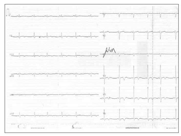
Figure 2. Prolonged QT (0.50 sc)