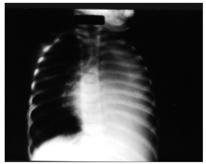
Figure 1. Preoperative chest X-ray

Isolated mitral valve disease is uncommon in children. Congenital mitral valve diseases commonly associated with obstructive malformation of left ventricular outflow tract, valvular and subvalvular aortic stenosis and coarctation of aorta (4). Our pa-