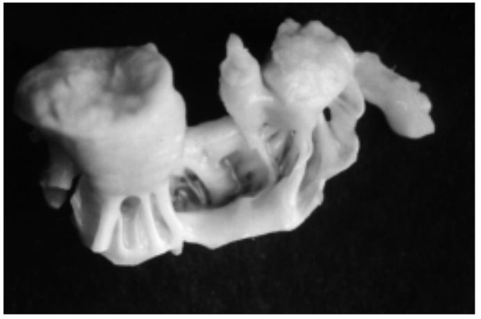
Figure 3. Resected mitral valve of patient