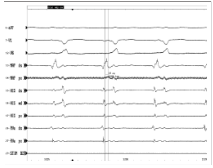
Figure 2. Intracardiac electrograms at the successful cryoablation location. Local ventricular activation at the mapping catheter is 37 msec earlier then delta wave

The patient presented here, had a right anterolateral AP where we failed to obtain stable catheter position and temperature despite using a long sheath to stabilize the RF ablation catheter on the tricuspid valve annulus. Another common issue regarding catheter stability is the catheter dislodgement due to the AV dissociation occurring after the elimination of AP conduction when RF ablation is being performed during ventricular pacing in some unstable locations (6). Therefore, catheter dislodgement during RF ablation may result in failure of elimination of AP in relatively unstable locations. This was not the problem in the current case due to the transition from preexcitation to normal AV conduction in sinus rhythm.