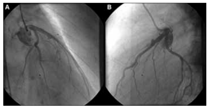
Figure 2. CAG views revealing an aneurysm originating from proximal LAD. Right anterior oblique (A, Video 1) and left lateral (B, Video 2) views CAG - coronary angiography, LAD - left anterior descending artery

MCA - middle cerebral artery, MRA - magnetic resonance angiography