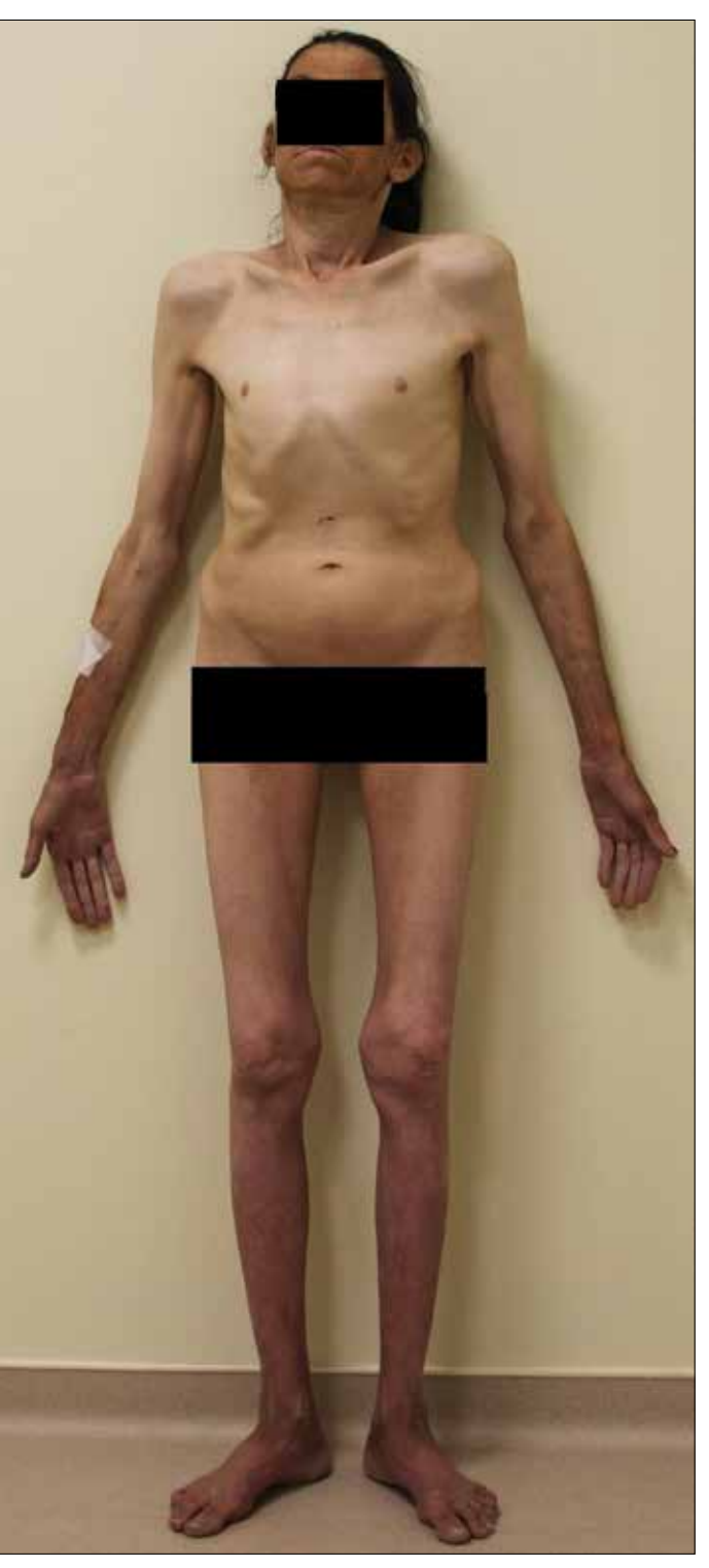
Figure 1. Gross appearance of the patient revealing macrocephaly, acromegaloid facial appearance, arachnodactyly, pectus carinatum, bilateral amazia, and mild scoliosis

chromosomal abnormalities. All 12 exons of the LMNA gene were screened for mutations by direct sequencing, but no mutations were detected. The patient was discharged on the fifth day of hospitalization. Due to non-adherence to the medical treatment, there were recurrent hospitalizations with heart failure decompensation, and she died 4 months after diagnosis.