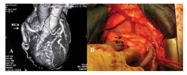
Figure 2. A) Multislice computed tomography angiography view of aneurysmatic right coronary artery originating from the aorta, B) Intraoperative view of the aneurysmatic dilatation of the right coronary artery due to high flow

it was closed primarily by Teflon pledgeted 4/0 polypropylene sutures. Excessive systemic collateral flow was impeding exposure despite a properly placed aortic cross-clamp and a fully arrested and vented heart. Intracoronary shunts (ClearView® Medtronic Inc. Minneapolis, MN, USA) were used to divert flow away from the site of anastomosis. Left internal mammary artery and a saphenous vein graft were anastomosed to LAD and circumflex artery respectively. The patient was discharged on the sixth postoperative day after an uneventful recovery. He is well and free of ischemic symptoms in his second year following the operation.